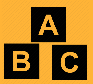
Step 9: Eligible children entering WV will enroll at the Learning Center, be placed on a wait list, or referred to another quality learning program.