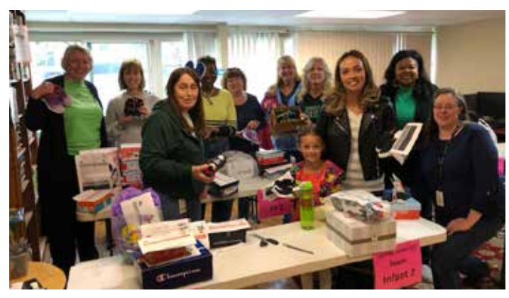
2019 Shoe Drive Volunteers

Is there a special memory you would like to share about a child or resident family? It is very exciting each year as I watch children progress through the Warren Village Learning Center and the happiness I feel watching their eyes light up when they get new shoes! I have watched employees advance and grow into positions at Warren Village and that is wonderful to see as well.