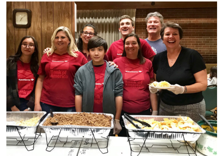
Bank of America