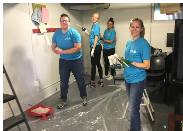
Guild Education employees painting the Warren Village Kids Club, October 2019.