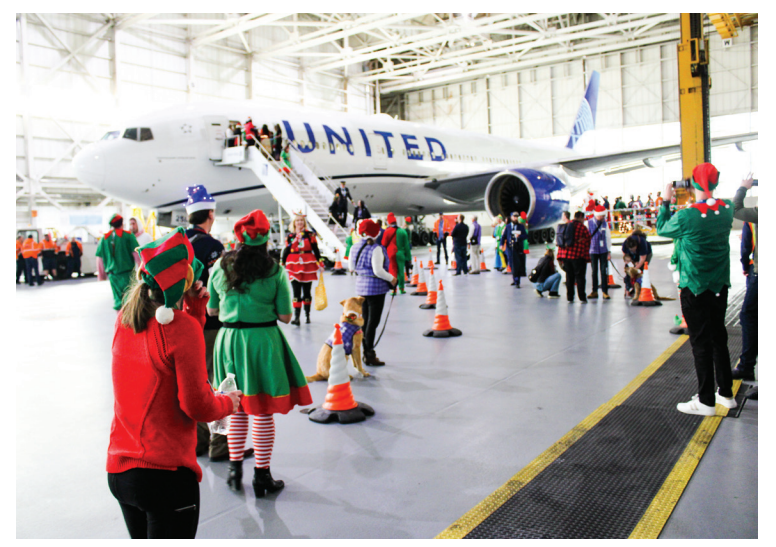
Warren Village families and staff take an exciting flight to the "North Pole", where gifts, Santa, and elves await in a magical winter wonderland!

Like many of us, United has recognized that the rising costs of food, housing, childcare and healthcare in Denver have overwhelmed many families in our city. This pressing challenge drove United to support Warren Village as we address these challenges head on.