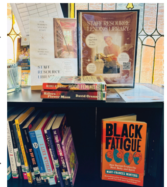
The Staff Resource Library

Resident-Alumni Advisory Council: We are in the pre-planning stages of forming a Resident-Alumni Advisory Council to help shape organizational initiatives. We are still in the incubation stage, so please stay tuned.