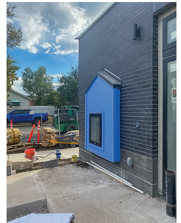
From left to right: A completed kitchen in an apartment; a view into the neighborhood from a corner apartment; a full bathroom in an apartment; a view from the playground of one of the Early Learning Center classroom windows, each of which has its own unique color.