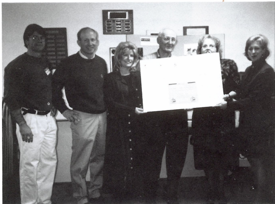
Adult sponsors of Bradford Elementary, representatives from Wendy's™, and Warren Village celebrate the presentation of the partnership to raise funds for Warren Village children